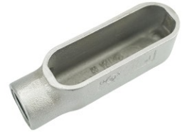
Tabel 1 - Dimensions of form 7 conduit body E type