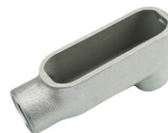
Table 1 - Dimensions of form 7 conduit body LB type